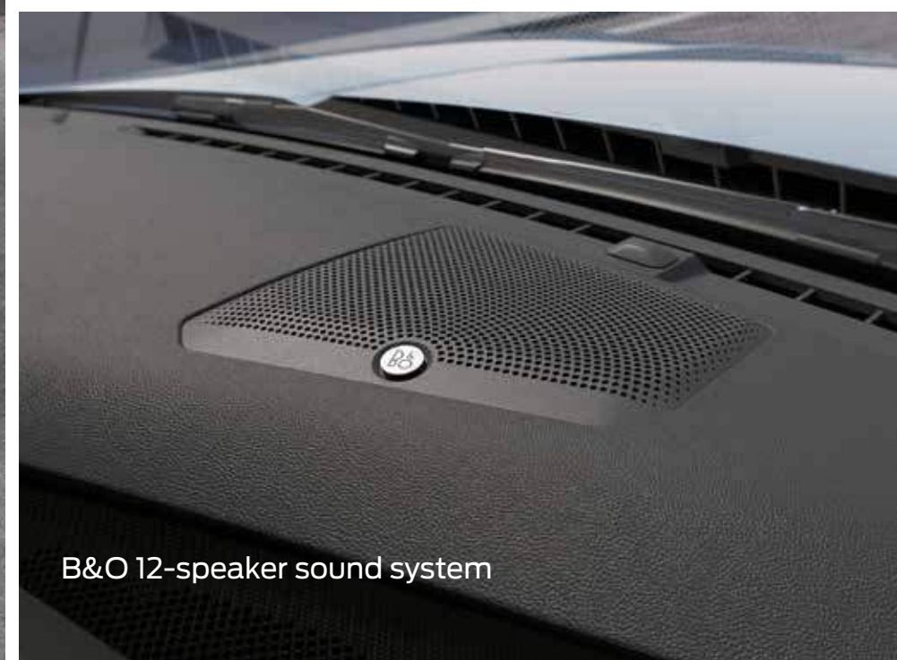
B&O 12-speaker sound system