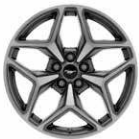
19" X 9" (F) / 19" X 9.5" (R) Machined with Tarnished Dark Aluminium Wheels (Optional GT Wheel)