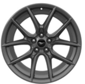
19" X 9.5" (F) / 19" X 10" (R) Tarnished Dark-Painted Low Gloss Aluminium Wheels (Dark Horse Wheel)