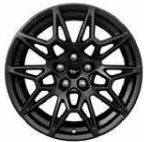
19" X 9.0" (F) / 19" X 9.5" (R) Ebony Black-painted Aluminium Wheels (Standard GT Wheel)