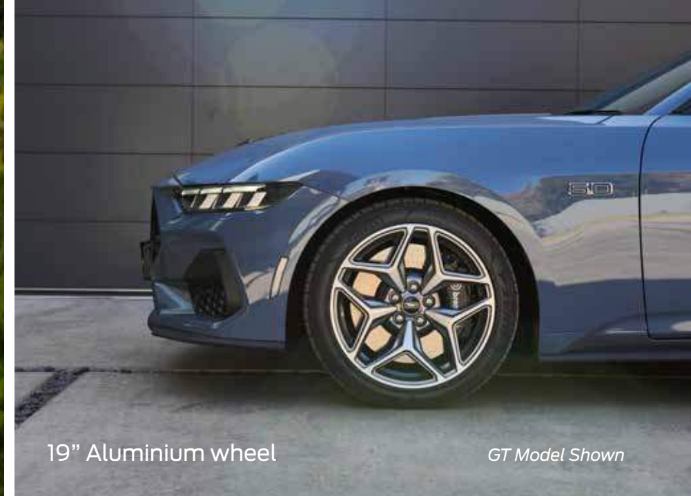
19" Aluminium wheel