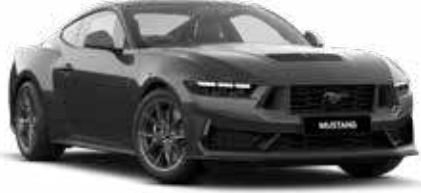
Dark Matter Grey